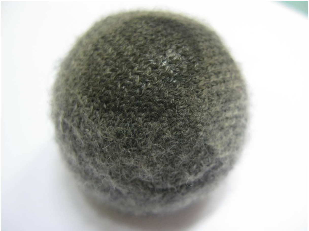
Figure 4 Silent Socks B2 after 40 000 cycles