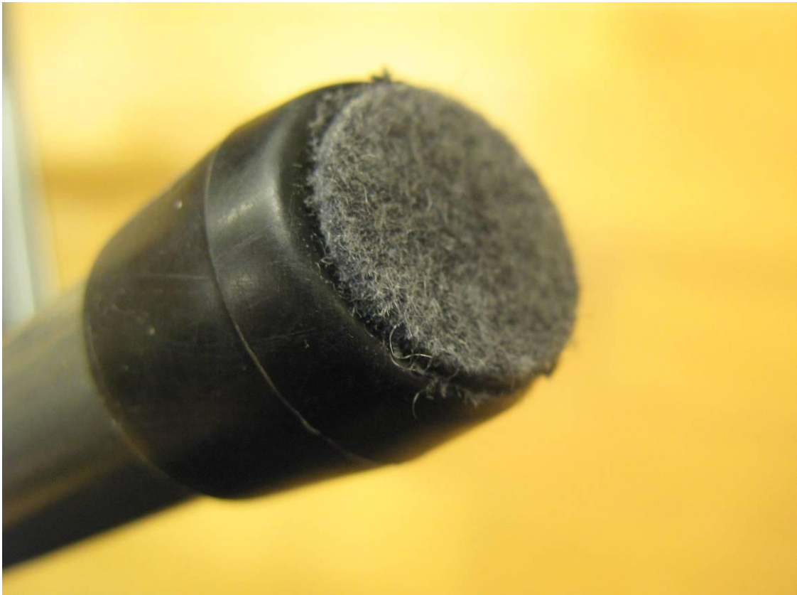
Figure 10 Ackurat furniture pad