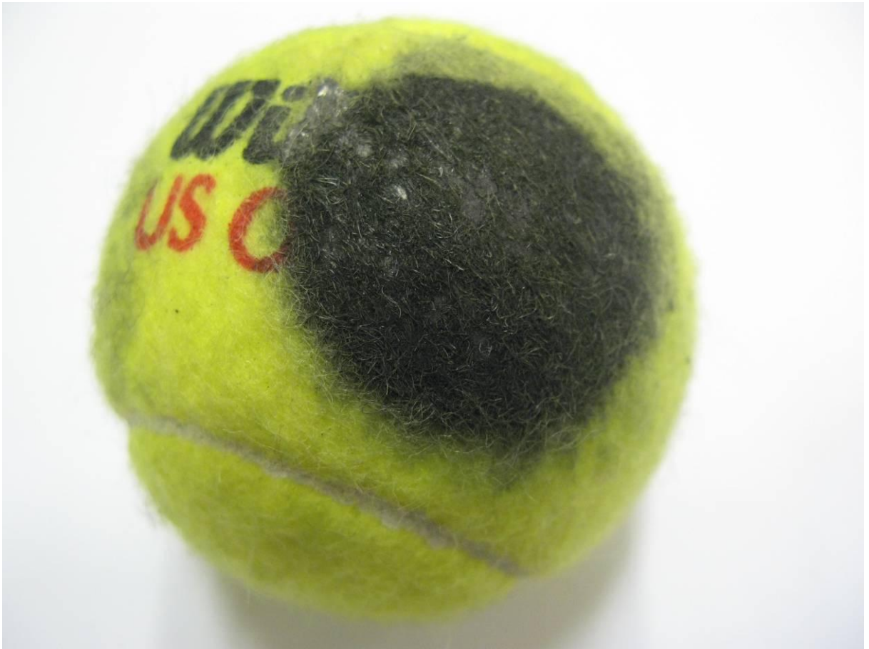
Figure 8 Tennis ball 2 after 23 000 cycles