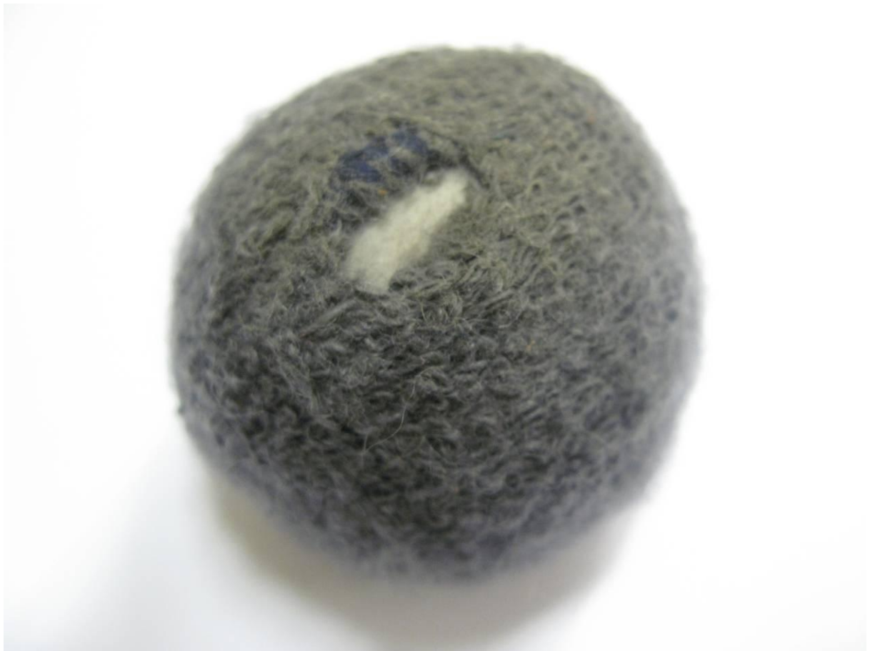
Figure 5 Silent Socks C1 after 23 000 cycles