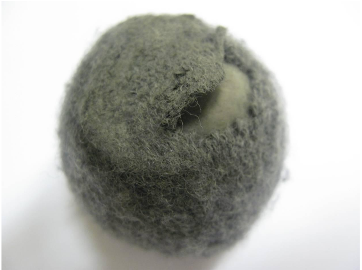
Figure 6 Silent Socks C2 after 5 000 cycles