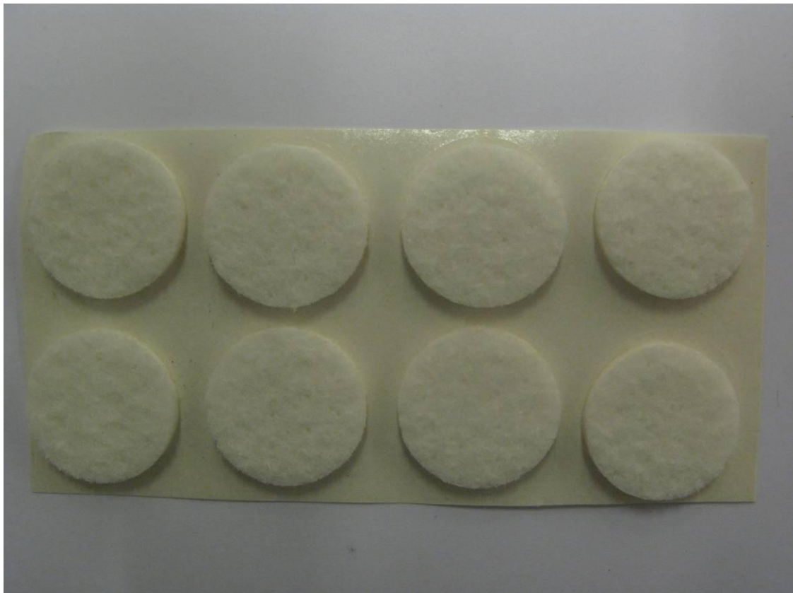
Figure 9 Ikea Furniture pad Praktisk