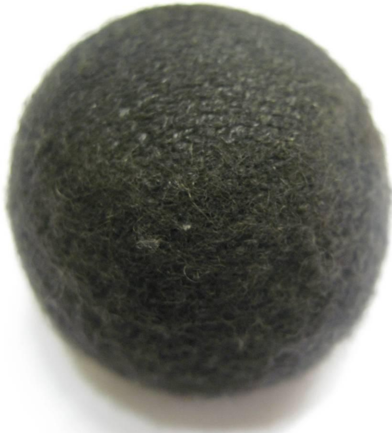
Figure 3 Silent Socks B1 after 40 000 cycles