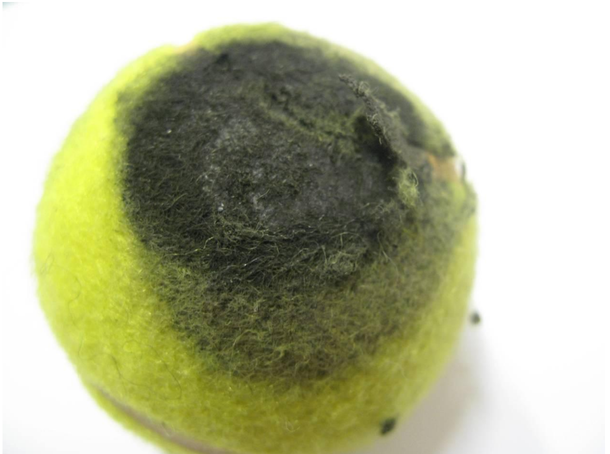
Figure 7 Tennis ball 1 after 23 000 cycles