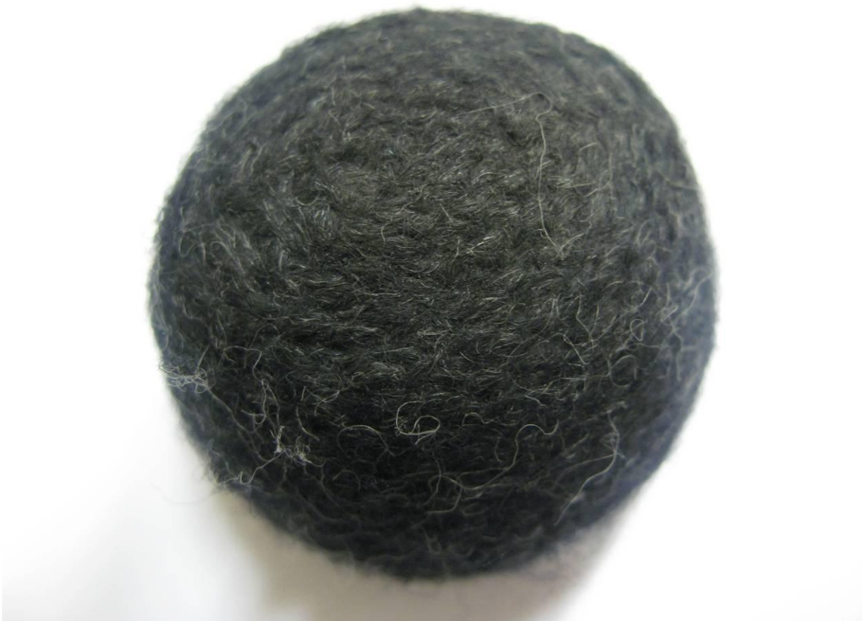
Figure 2 Silent Socks A after 40 000 cycles