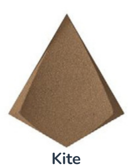
Panels to make up 1sq metre: 40 Thickness: 0.8" - 1.1" Dimensions: 8.2 \times 9.5 \times 1.1 (Inches)